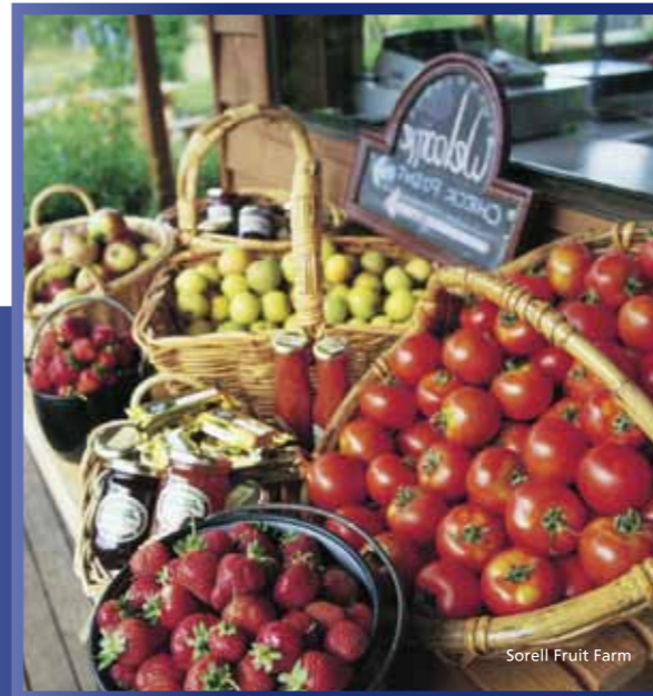
Sorell Fruit Farm